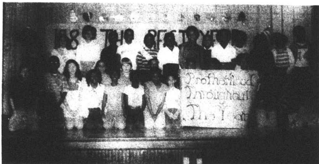
The members of the cast after giving their performance.