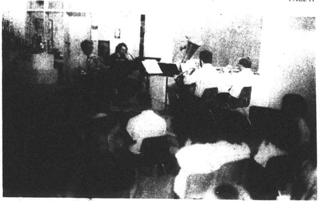
VISITING MUSICIANS -- The Brass Quintet of the North Carolina Symphony is shown here playing a concert Friday in the Band Room of Hoke County High School. This group, the Woodwind Quintet and the String Trio, both also part of the North Carolina Symphony, gave performances and held Master Classes at Hoke County schools that day.