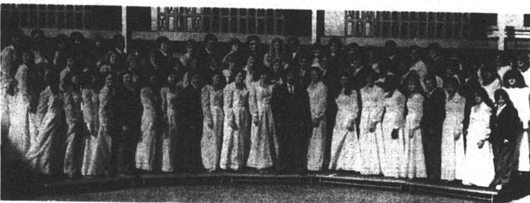
Hoke High Chorus which won a Superior rating Friday at Fayetteville. The Hoke Chorale also was rated Superior.

The members of the chorale would like to thank the people of Hoke County whose generous support helped to make this trip possible.