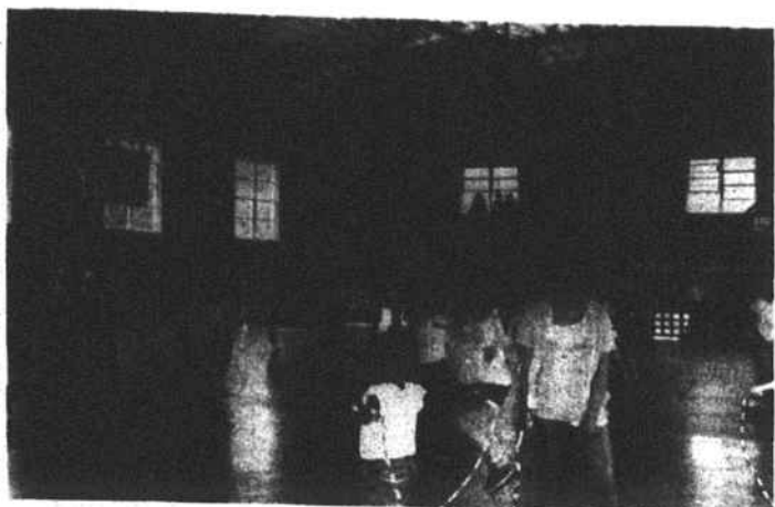
Jumping at J.W. Turlington.