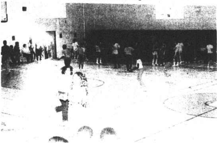
Hoke High jump.