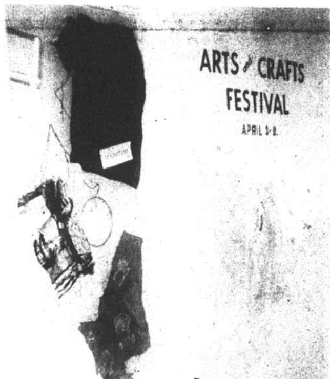
Iris Barbour's needlecraft display.