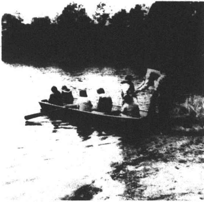
Neill McFadyen assisting Scouts in preparing for a boat ride.