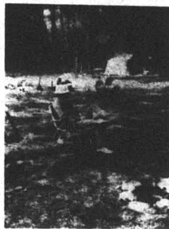
Bob Clark watching some Scout activities.