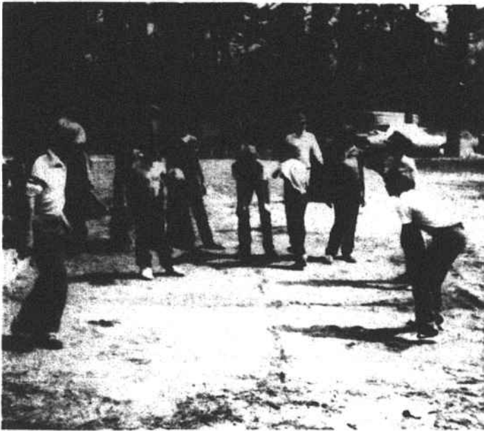
Scouts participating in an activity.

Thirty-five Boy Scouts of Troop 404 participated Saturday in the Third Western District Scout-O-Rama at Laurinburg High School. After participating in various activities, they left for Lake Alice for a Father-Son Overnight Camping Trip. The troop was joined by 19 fathers who prepared meals including hamburgers, pork chops, steak, venison, sweet-and-sour pork, and hot dogs.