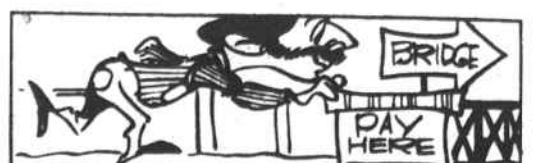
In 1937, pedestrians paid a nickel to be the first to walk across the just-open Golden Gate Bridge in San Francisco.

Sponsored by Hoke County Parks and Recreation Commission