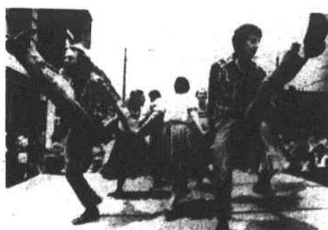
The Apple Chill Cloggers