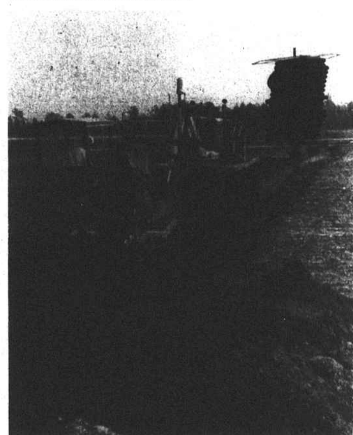
TILE MACHINE -- This tile machine, made in Germany by Hoes Co., is one of four in the U.S. It is powered by a 450 HP aircooled engine and installs tile at the rate of 100 feet per minute.