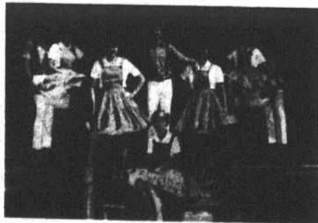
The Down-Home Cloggers