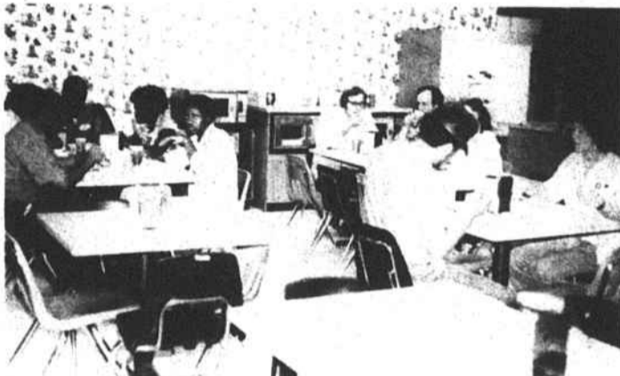
April birthday employees having birthday lunch and going through the 'chow line' in the plant cafeteria Thursday.