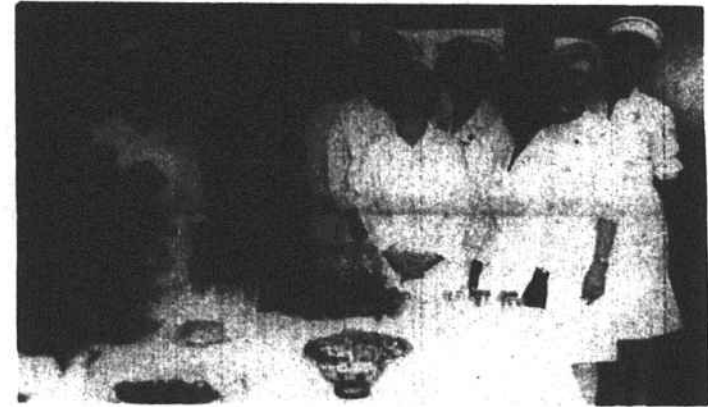
AT RECEPTION -- Some of the McCain Hospital nurses, and other members of the hospital staff are shown at a reception held the afternoon of May 5 in honor of the hospital's nurses. The occasion was the observance of National Recognition Day for Nurses and Nurse's Week in North Carolina May 2-8.