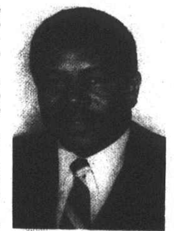
Vote for Honesty, Justification and Integrity