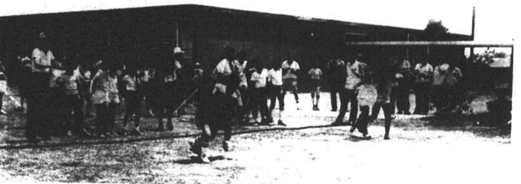
WEST HOKE FIELD DAY - West Hoke School's students competed Friday in a variety of events. Here are two pairs of contenders heading for the finish line in one of the three-legged races.