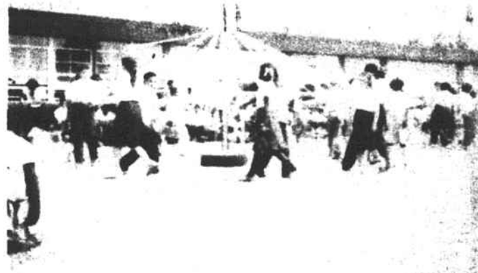
Fourth Grade students wrap the May Pole during the May Day festivities at West Hoke.

As the Royalty descended the platform for the recessional, and as the subjects of the land watched our Majesties, it was obvious from the resounding applause that this, West Hoke's first May Day festivities -- was indeed a Success with a capital S, and was truly an EXTRAVAGANZA!