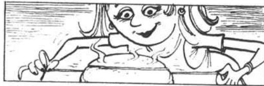
If a cake is to be cut while hot, use unwaxed dental floss instead of a knife.

If you have been successful in sales, give me a call. I manage one of the best sales teams in the area, for the number one company in the Carolinas; and I am looking for an individual to bring on to this team. A background in sales is desirable, but it's more important to have the ambition and know how to succeed. Call me at 919-739-4153, between the hours of 9 till 5.