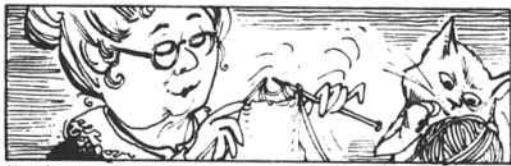
It takes a skilled knitter one minute to make 100 stitches by hand.