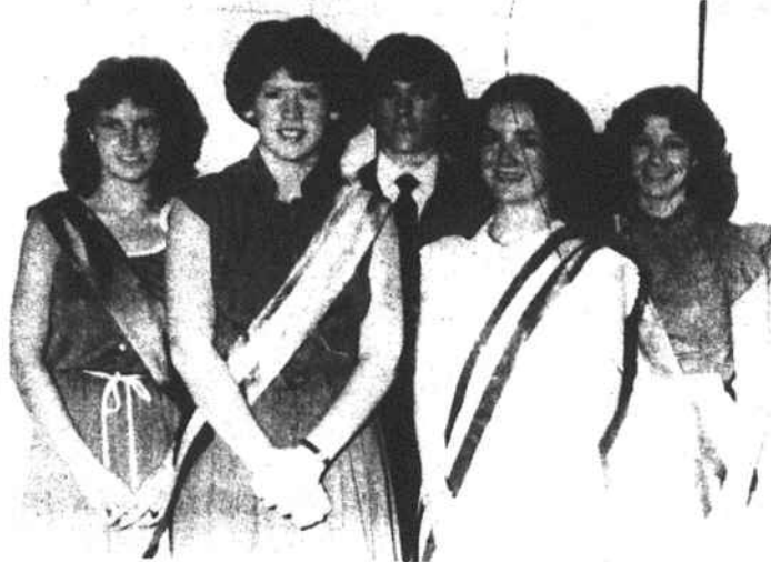
Flora Macdonald Academy's junior marshals.