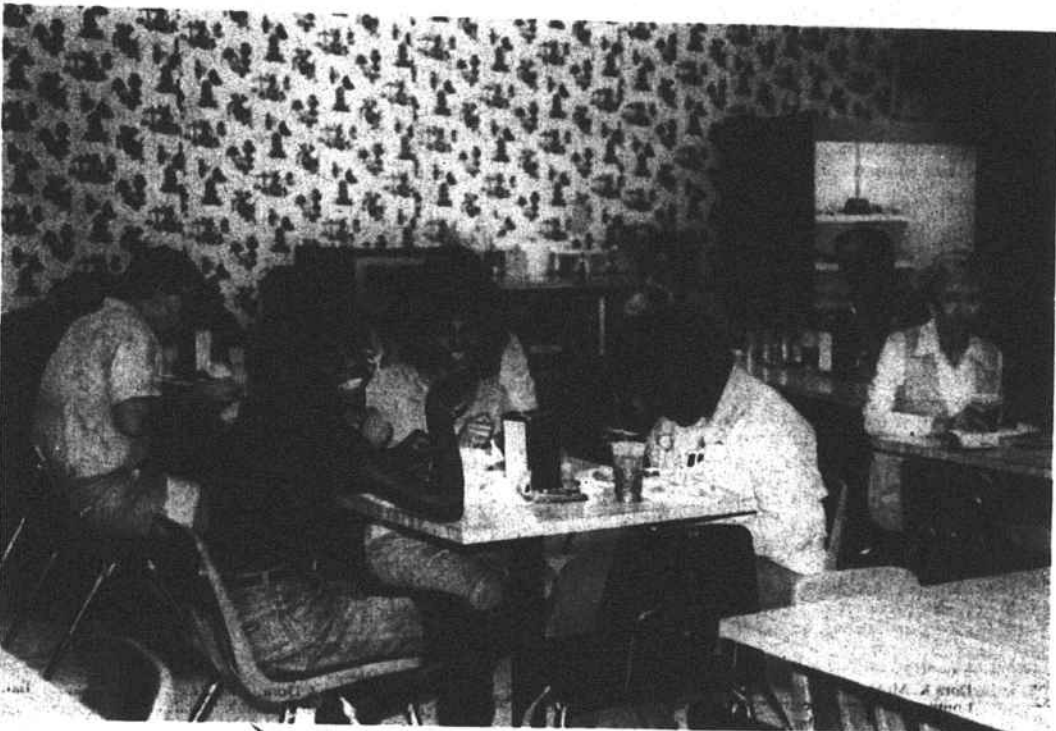
Some of the guests at the May birthday lunch.