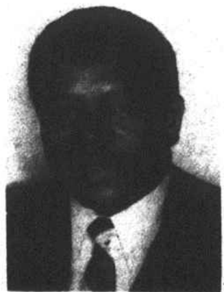
Paid Political Adv.