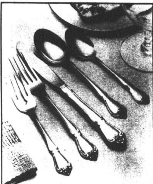
DeBonair Shown above: Stainless flatware in the exclusive DeBonair and Old Baroque patterns. Old Baroque