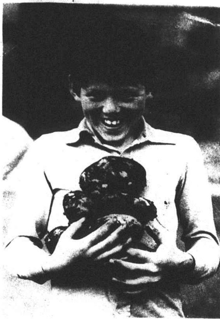
An Irish lad carries recently harvested potatoes home for his family's dinner. Valued worldwide for nutrition and versatility, spuds grow in more countries than any crop except corn. Although potatoes are native to South America, the Irish and East Europeans lead the world in per capita consumption.

food in many poor nations. A common expression in the Dominican Republic, "estar en las papas" (to be in the potatoes), means a person is successful enough to