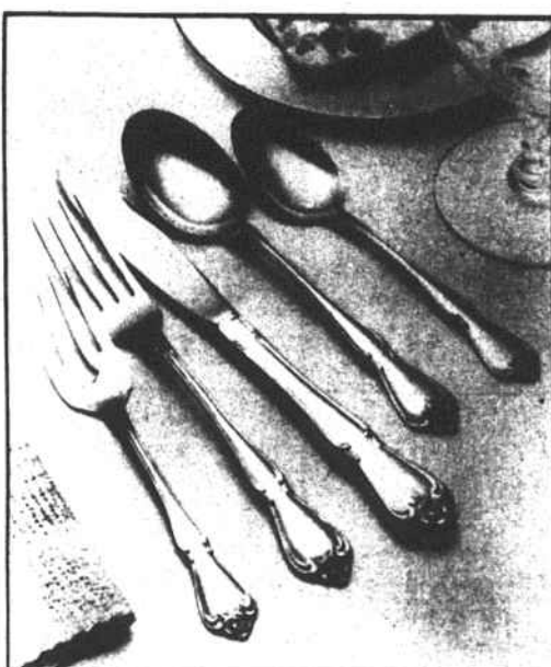
DeBonair Shown above: Stainless flatware in the exclusive DeBonair and Old Baroque patterns. Old Baroque

COMPLETE YOUR PATTERNS NOW FREE! 5-piece place setting of handcrafted stainless