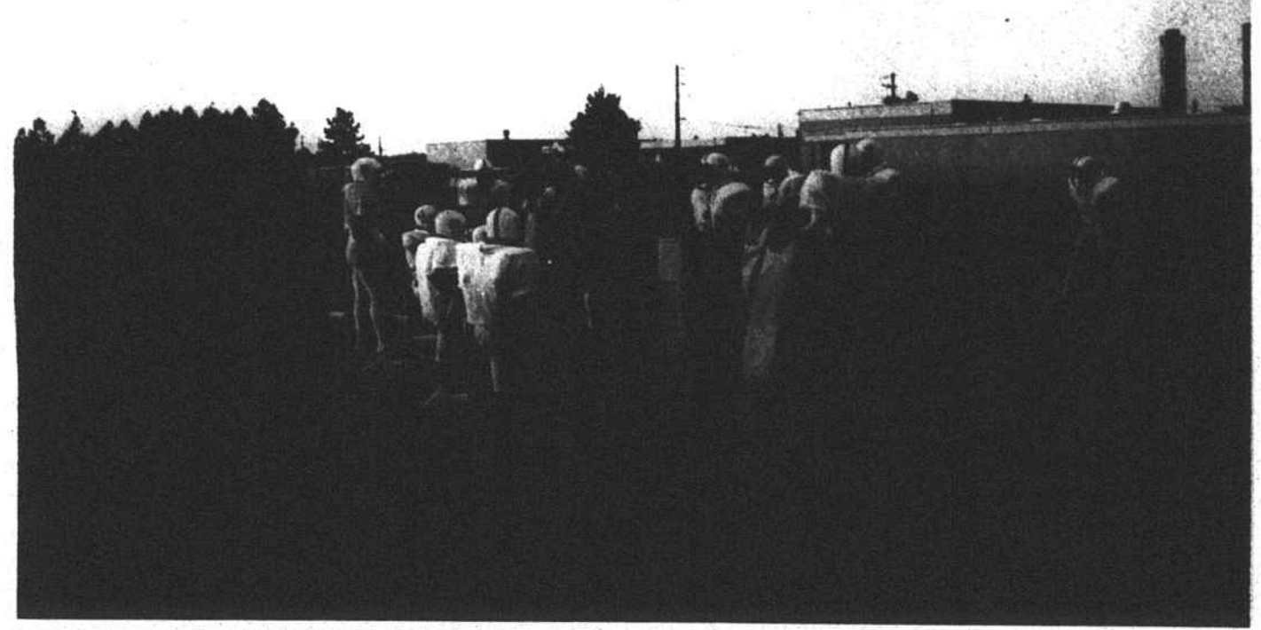
Getting Ready -- Members of the Hoke High football team are spending this week getting ready for Friday nights game with South View. The game