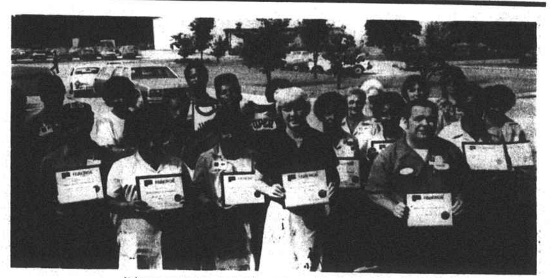
Faberge employees are holding their perfect-attendance certificates.

Unemployed workers as well as employers are urged to contact the Employment Security Commission local office serving their area for more information about Federal Supplemental Compensation Program.