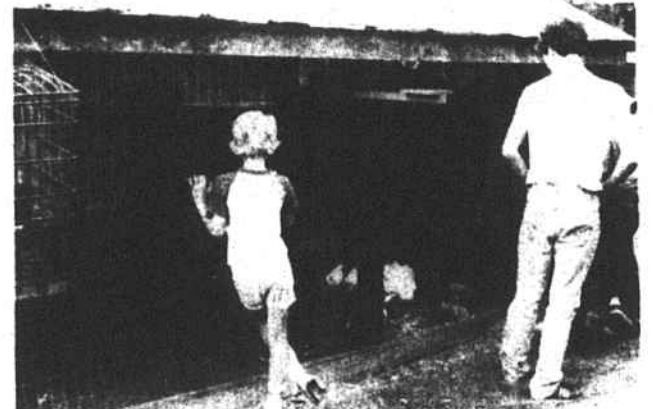
The 4-H Pigeon Club meets and learns more about different breeds of pigeons and raising them.