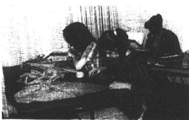
4-H offers sewing classes for youth with the help of volunteer leaders. The 4-H Fashion Revue is also a popular activity.