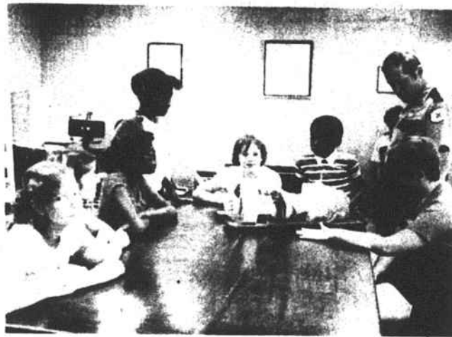
First aid and CPR is an important project for 4-H'ers to get involved in.