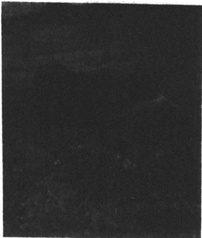
Ball mouth -- This dog is noted for his ball catching. The News-Journal caught him in action the other day on Carl Miller's farm.