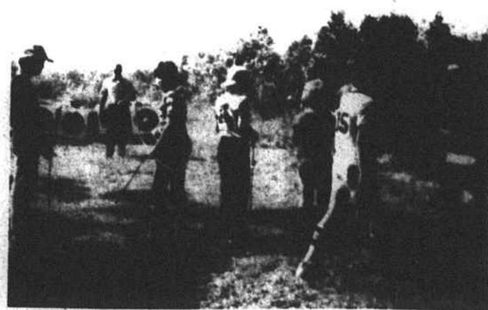
Home on the [archery] range at Sinclair Pond.