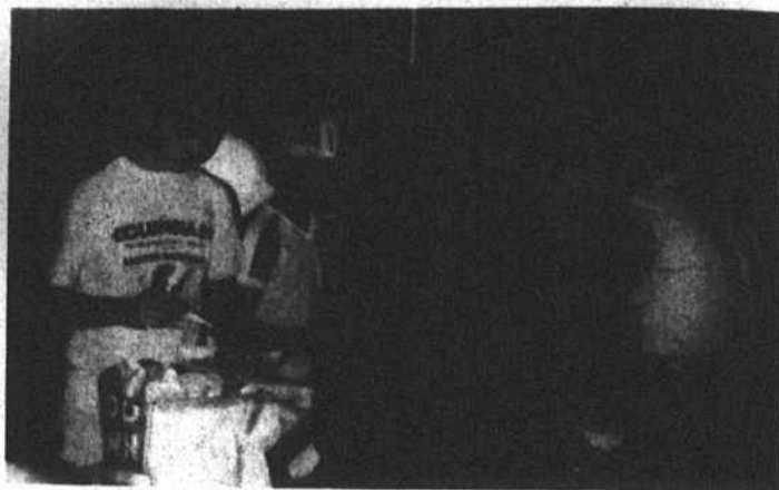
Giving and receiving the barbecue dinner at the camp-out.