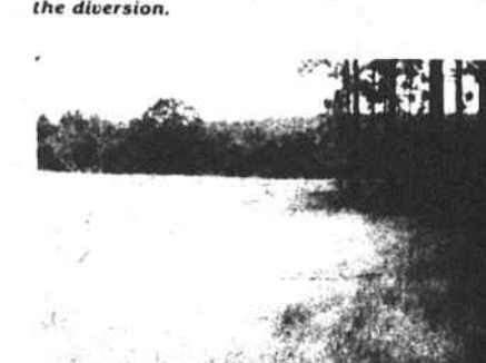
Bahiagrass is a hearty erosion control grass on sandy soils. Bahia is preventing silting and gully ero-