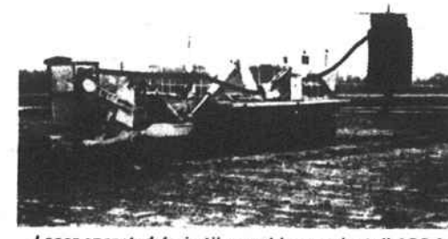
Laser operated drain tile machine can install 100 ft. of tile per minute. This past March, this machine alone installed 131,276 ft. on Hoke County farms.