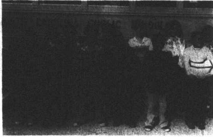
South Hoke School students are shown here just before they boarded the bus for the overnight camp outing October 13.