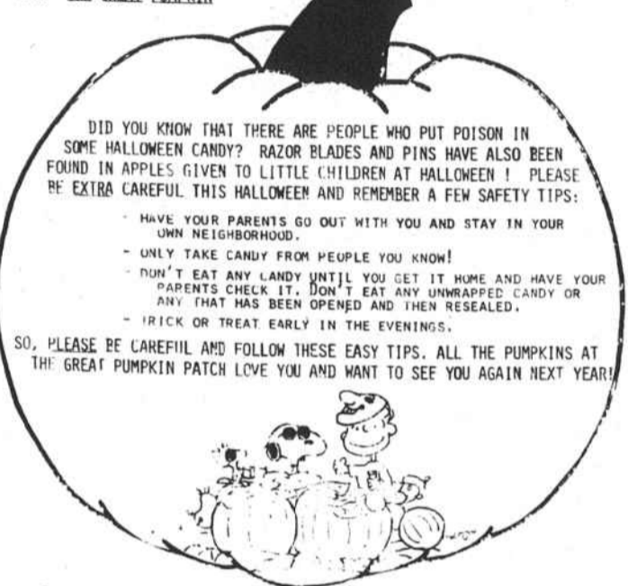
Posters being circulated in the county warning Trick or Treaters.

TO: ALL HOKE COUNTY SCHOOL STUDENTS FROM: THE GREAT PUMPKIN