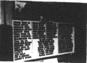
This sign at Arabia Golf Club lists the businesses which were the tournament's sponsors. Calico Corner was also a sponsor.