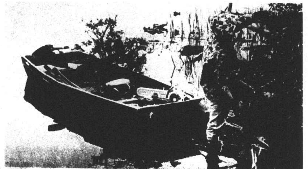
Duck hunting is a fine sport, but late-season hunters should beware of hypothermia — which is another name for exposure. Be especially careful operating small boats in cold-weather months when a capsizing could be disastrous.

Wildlife art prints and applications for lifetime licenses are available from the N.C. Wildlife Resources Commission, Division of Conservation Education, 512 N. Salisbury St., Raleigh, N.C. 27611.