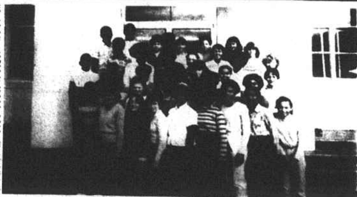
Members of the Upchurch Drama Club who will perform in the upcoming production of "Miss Lonelyheart."