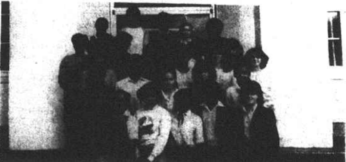
The Upchurch Dance Group is also performing in "Miss Lonelyheart"