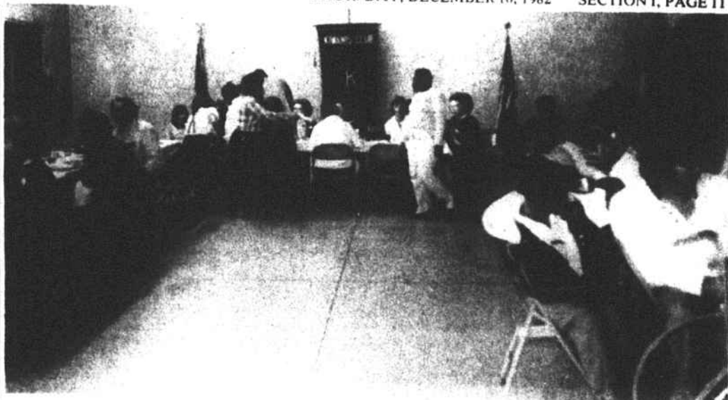
CHRISTMAS DINNER — Christmas dinner was held Friday from 10:30 a.m. till noon at the Hoke County Civic Center, for the students of the county Trainable Multi-handicapped Classes. Here are some of the teachers, parents and students at the dinner.