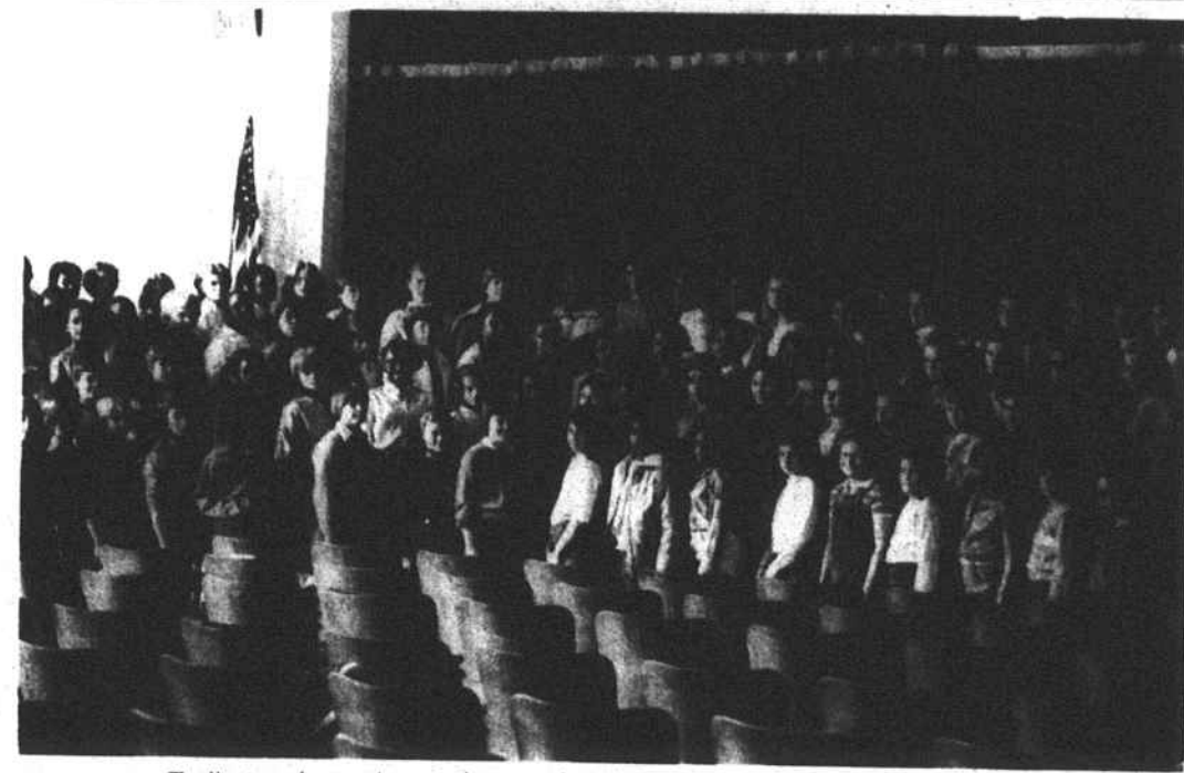
Turlington chorus singers who gave the musical "The North Pole Rock and Roll."