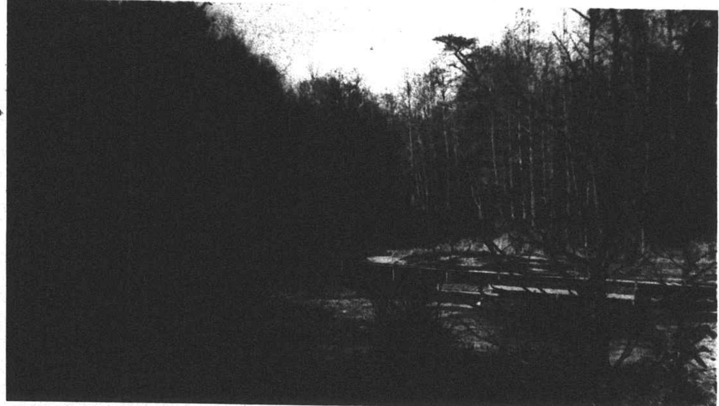
LITTLE ACTION -- This landing on Drowning Creek near the old Gilchrist Bridge at U.S. Highway 401 south sees little action from boaters

The next home match for the Buck's will be against Lumberton on February 1 at 7 p.m.