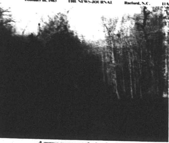
A cyprus swamp on the Lumbee River.

thage, nonsupport; defendant signed a voluntary agreement.