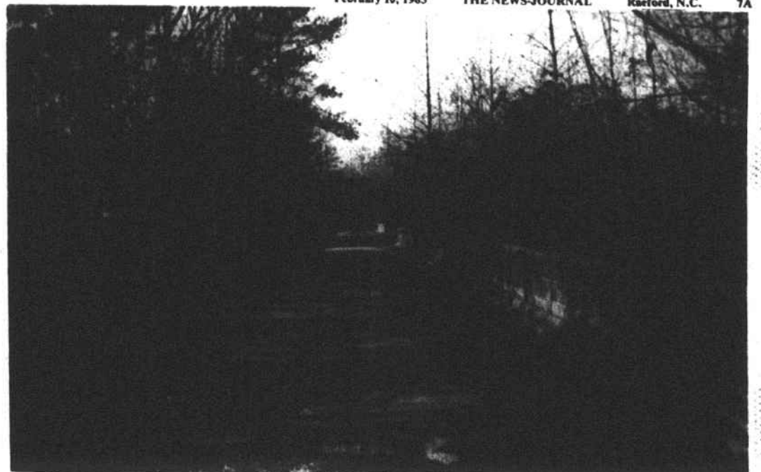
ROAD NOT TAKEN -- The old 1922 Gilchrist bridge over Drowning Creek, which once joined Hoke and Scotland counties, sees little traffic these days. The bridge was replaced by a newer structure more than a decade ago.