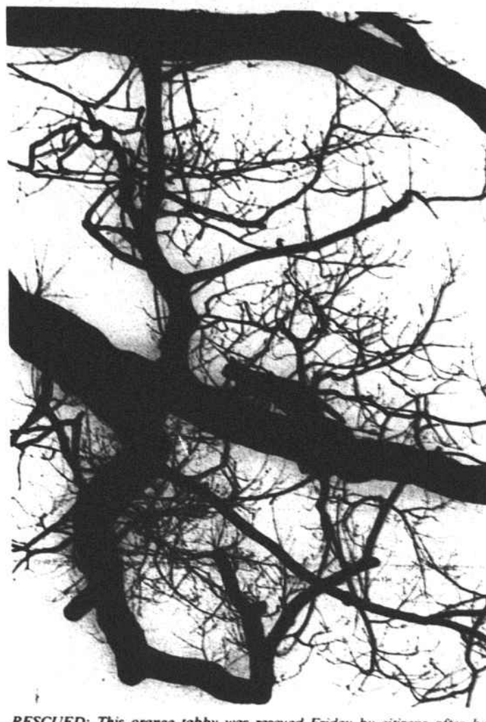
RESCUED: This orange tabby was rescued Friday by citizens after he allegedly spent almost three days in a large oak tree behind the Post Office. The cat was last seen walking down the unemployment line apparently looking for food.