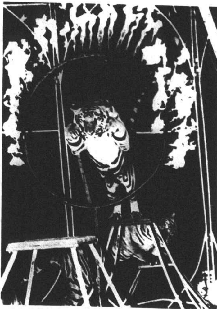
WATCH THAT TAIL -- ferocious felines will leap through a flaming hoop of fire during the Franzen Bros. Circus here on April 1.

--Charles Purcell, Raeford, obtaining property without consent, no less than 181 days and no more than 181 days suspended for two years with supervised probation, $150 and payment of cost, $139.86 restitution.