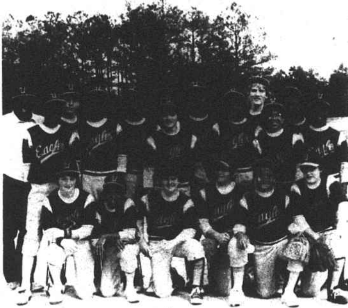
Eagles Readying -- Members of the Upchurch Junior High School baseball team are getting ready for the season opener against Hamlet on Friday. The Eagles play Hamlet in Hamlet, but will play the same team here on Tuesday. The Upchurch boys will also play this schedule: March 18, Hamlet, Away, March 22, Hamlet, Home, March 24, Anson, Away, March 31, Anson, Home, April 14, Irwin, Away, April 19, Edgewood, Away, April 21, Hillcrest, Home, April 26, Irwin, Home, April 28, Edgewood, Home, May 3, Hillcrest, Away, May 5, Irwin, Away, May 10, Edgewood, Away, May 12, Hillcrest, Home.

The PSU TV project at last report had $15,404 in cash toward the $55,479 needed in matching funds to qualify for $145,000 from the U.S. Department of Commerce. However, the TV Project also has pledges amounting to $22,370.