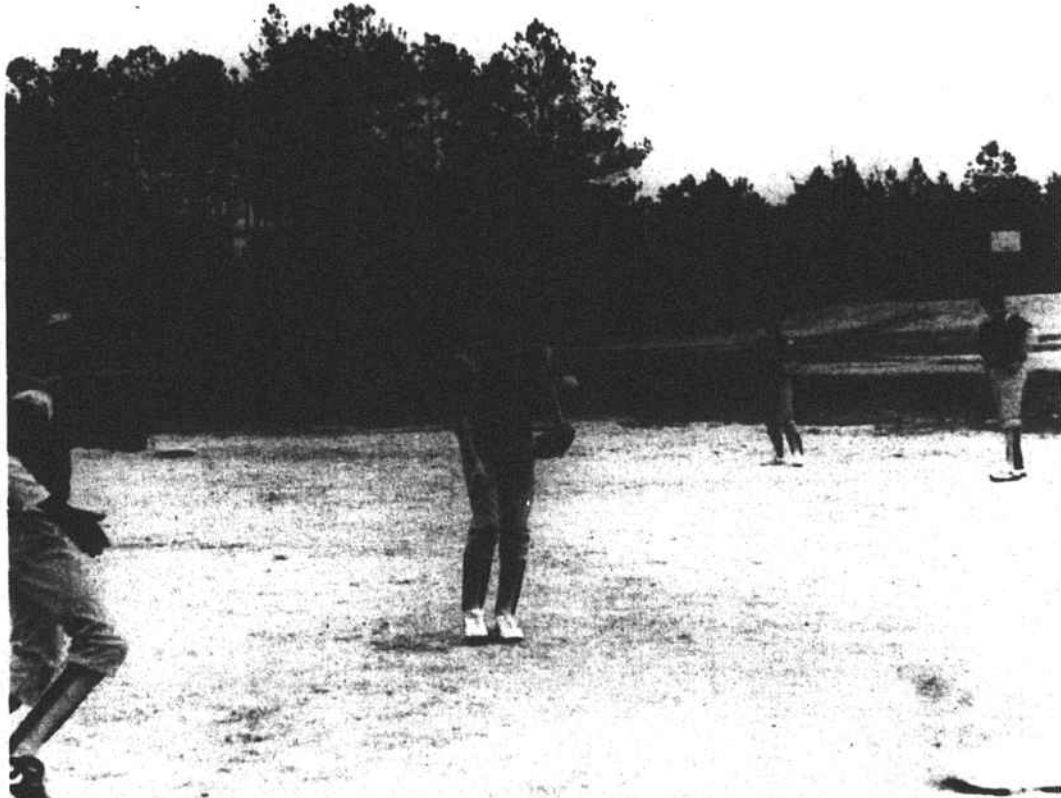
Where Is The Ball?

The public is invited and encouraged to attend. Your support is greatly appreciated by the students.