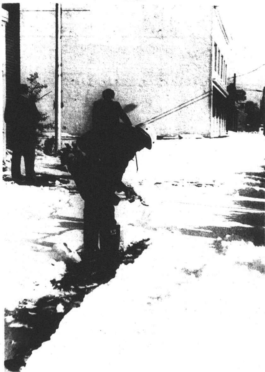
Tunneling through After Thursday's unexpected accumulation of 6 inches, Friday was a day for tunneling a path through to the various businesses who decided to open as usual.