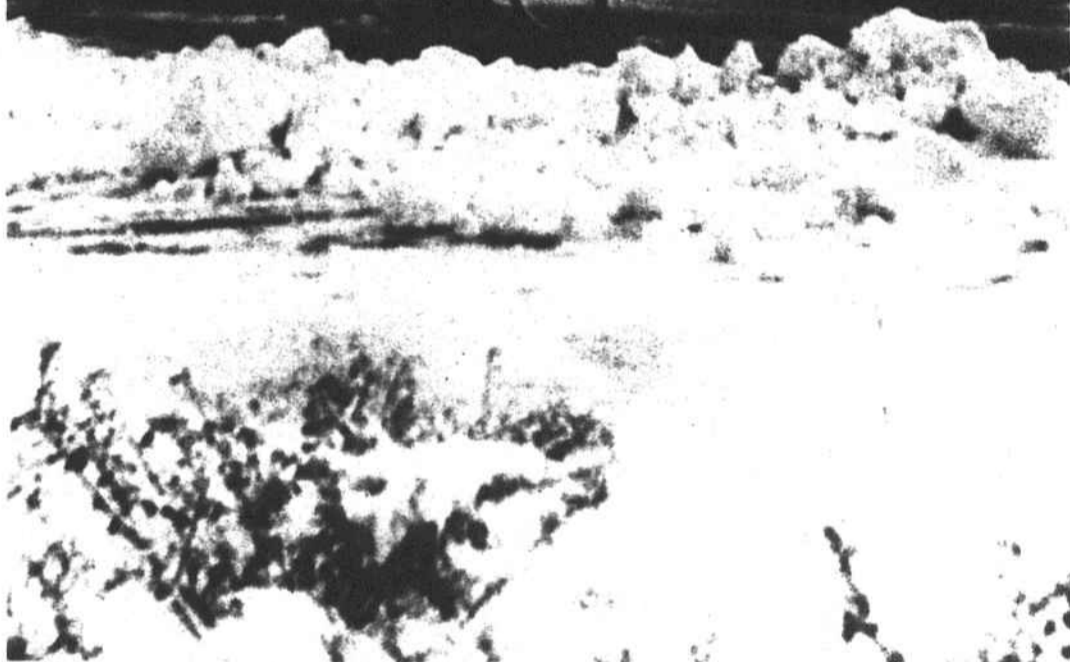
Mastering the slush Biking through the ice and snow on Main Street could have been a little slippery but not for this youngster who battled it all just to get out of the house. Schools were closed Friday.

FARMER FRIENDS Designate Your 1983 Tobacco to the Big Lumberton Tobacco Market 6 BIG WAREHOUSES TO SERVE YOU