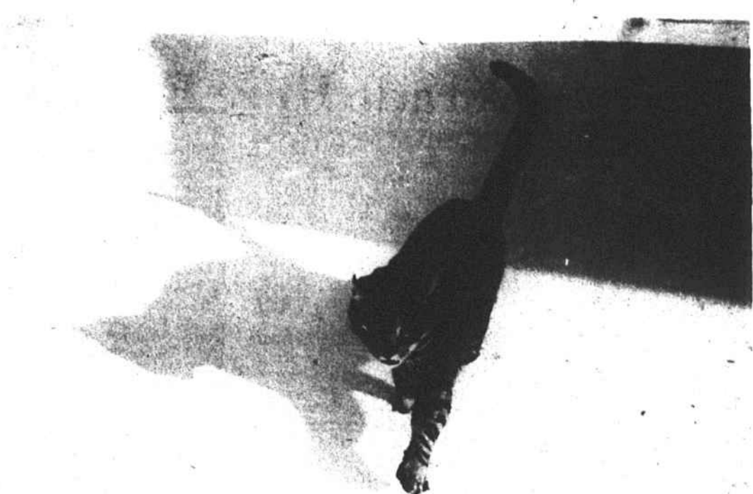
Pawprints in the snow Slowly and carefully he goes, making a deep path across the snow, heading for a warmer and dryer place to settle down.