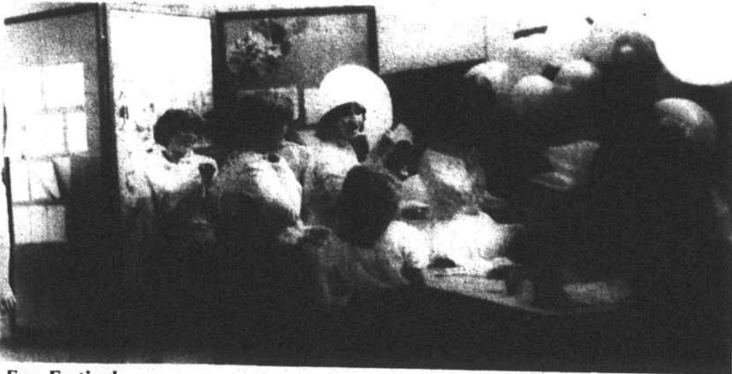
Fun Festival Colorful balloons, popcorn, cupcakes, continuous entertainment and performances by the Upchurch choir, all were part of Thursday's arts festival which was put on by the students at Upchurch. Paintings, collages, and paper flowers were just some of the arts shown off at the all day festival.