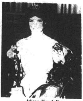
Miss FMA Crowned On Wednesday night, April 20, the elegant historic auditorium of Flora Macdonald Academy was the site of the crowning of Miss FMA of 1983.