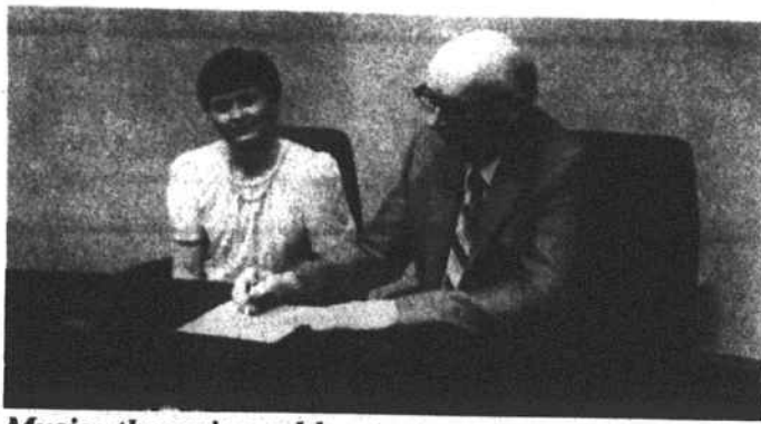
Music: the universal language

DID BETSY ROSS MAKE THE FIRST FLAG? The widely publicized story that Mrs. Betsy Ross made the first Stars and Stripes at the request of a committee headed by George Washington was first made public by a grandson of Mrs. Ross in 1870, nearly a hundred years later. Historians have been unable to uncover any reliable record of the event.