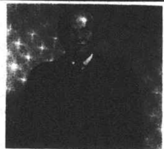
of the Antioch Church, last month preached the sermon at the church's Sesquicentennial.