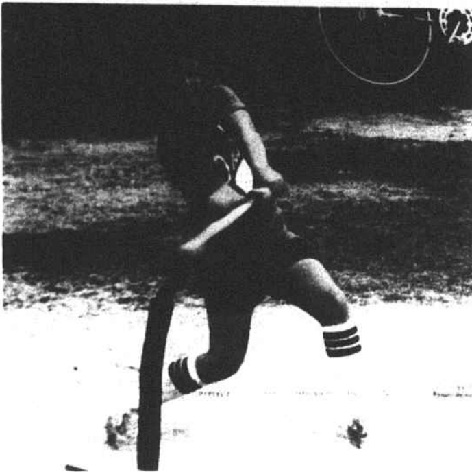
What a swing! This young T-ball player puts everything he's got into this swing as he rips the ball off the tee during a game last week.

A.A. Meetings Wed. 8 p.m. Nursing Home Dining Room