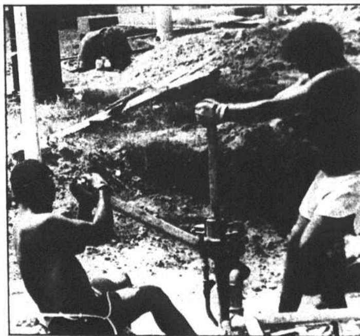
Working as usual

For some, the hot weather does not alter the day's routine. It just makes it harder. This fellow mowing his lawn (above) tries to stay in the shade, but with little success, while there are few hot-day benefits, except for a sun tan, for these workers installing gasoline lines a newly remodeled Raeford service station.