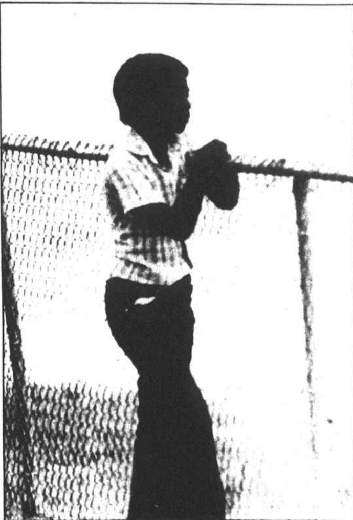
Dreaming of cooler days

Even with all the moans, groans and complaints that have been heard over the last month, most are not eager for another April snow. They probably would rather sweat through another day than slosh through the rain, snow and sleet that is not too far in the past.