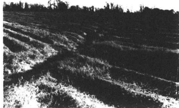
Cutting farm profits Gully erosion occurring in this soybean field cuts profits from the crop.

These are just a few of the conservation practices that will stop or reduce erosion problems on your land. For more information on erosion problems or for technical assistance, contact the Hoke Soil and Water Conservation District Office. Phone 875-8685 Mon. - Fri. Each year, the nation's largest estuary, the 4,400 square mile Chesapeake Bay, yields an average of 125 pounds of seafood per acre to sport and commercial fishermen, including 90 percent of the country's soft-shell crabs, according to the National Wildlife Federation. The Chesapeake is also the dumping ground for 400 million gallons of municipal sewage every day.