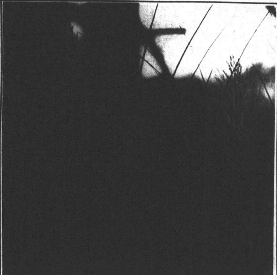
Sway away This pampas grass sits just outside of the door of a Hoke County resident, but the tall plant with silvery plumes is native of southern South America. If one