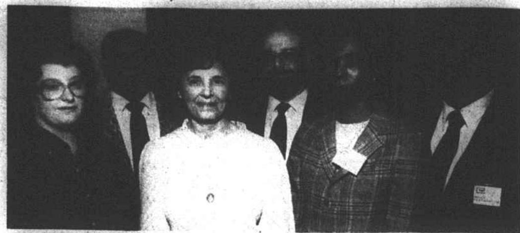
Attending state meeting Representatives of the Hoke County Extension Advisory Council were among more than 500 persons who were attending the State Extension Advisory Council Meeting in Raleigh. The meeting was held February 26 and 27 at the McKimmon Center on the campus of North Carolina State University. The group participated in training workshops and attended a legislators' banquet in which U.S. Congressman

Methodist College is holding a one-day workshop on Saturday, March 30, 9:30 a.m. until 4:30 p.m. for prospective and current aerobic teachers. Participants will learn new routines, teaching techniques, and injury prevention tips - everything needed to lead fitness classes in Aerobic Exercise and Jazz-Dance. Professional experience is not necessary. Cost is $80 and includes a reference manual and certificate. For more information, call Methodist College, 1-488-7110, extension 246.