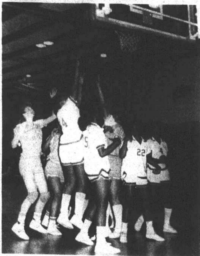
Up and in Although this shot went in for two points, the Hoke High School girls lost in the Southeastern Conference Tourney titles to Reid Ross by 10 points, 68-58. Despite the Friday night defeat, the girls are still the regular conference champions. The girls were 23-2 after Friday's action. Both losses were to Ross. The Hoke girls have beat last year's state champs once.