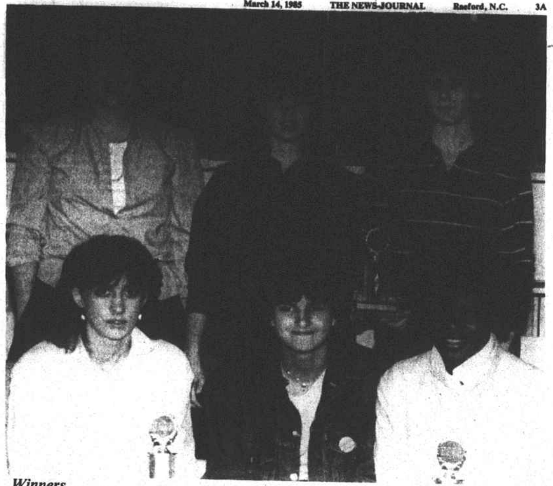
Winners These Hoke High students display awards garnered at a recent HOSA competition held at Fayetteville Technical Institute. The students are: First row (sit-