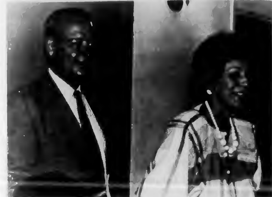
Broyhills visit Raeford